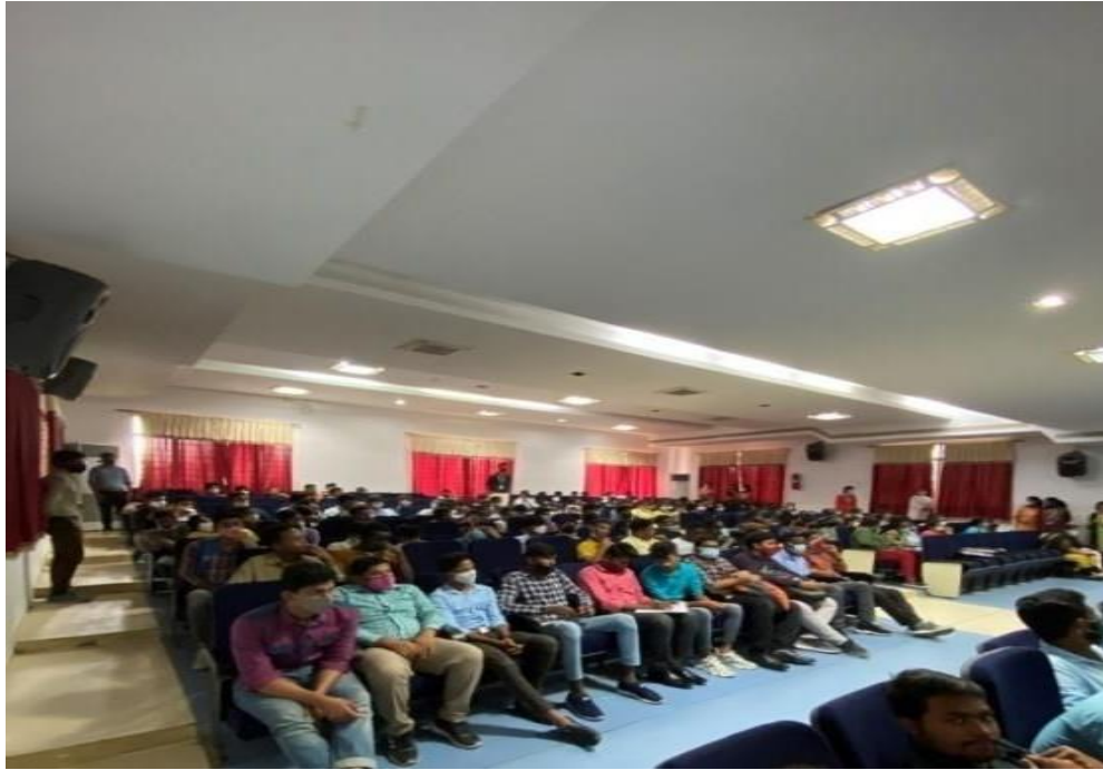
Participants on 2.8.2021