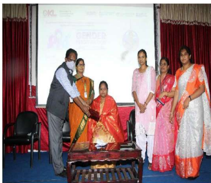
Inaugural & Felicitation of the Resource Person on 28.12.2021