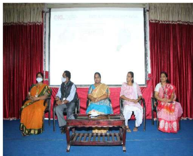
Dignitaries on the stage on 28.12.2021