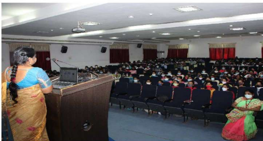
Chief Guest Addressing the Gathering on 28.12.2021