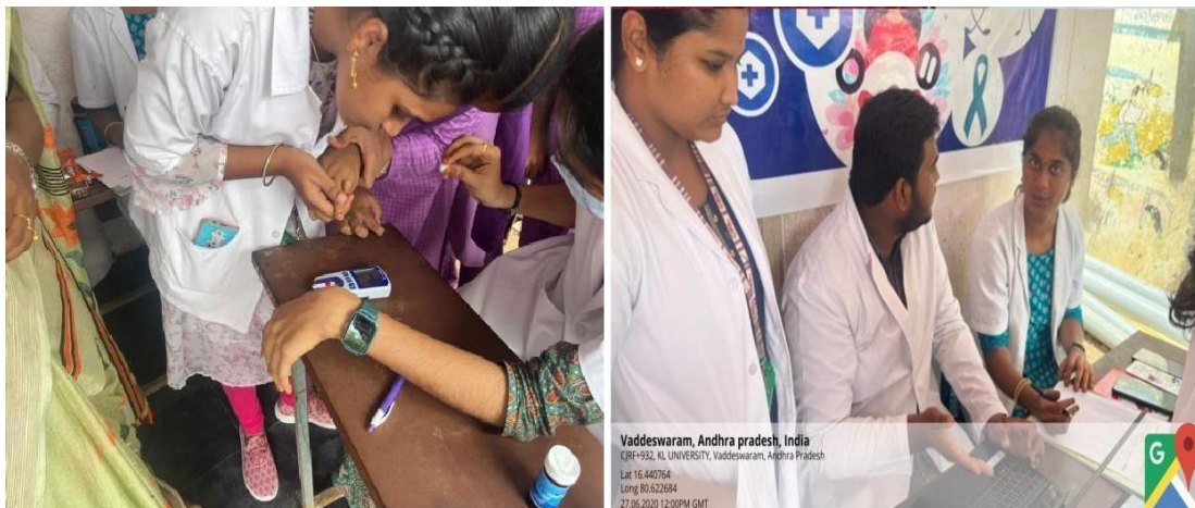
Haemoglobin testing for students on 27/06/2020