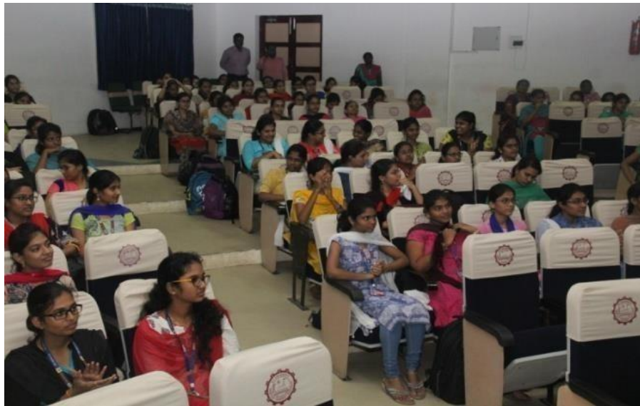
Audience Listening to the Guest on 18-08-2018