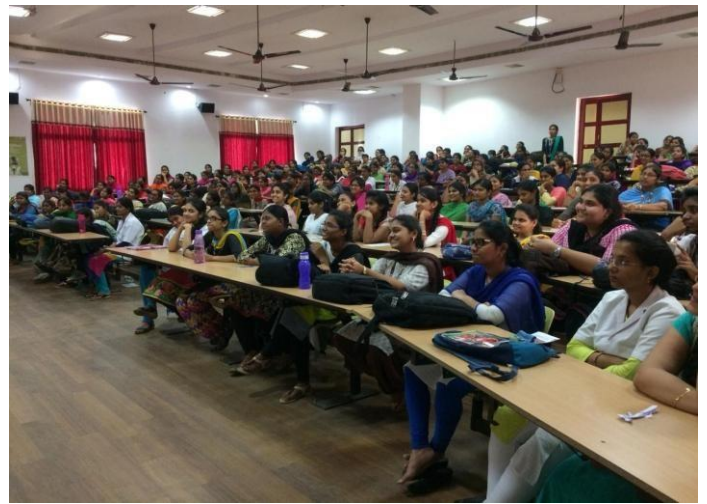
Students participation on 15/09/2018