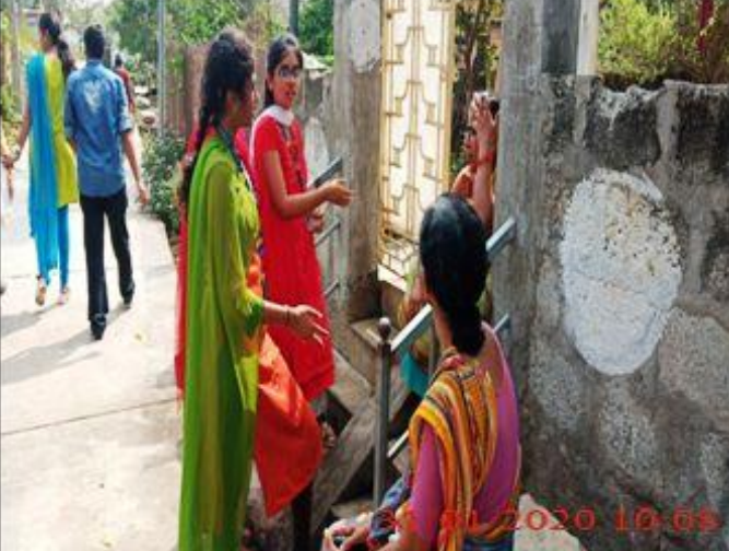
YRC Program Officer, Faculties, Student Volunteers